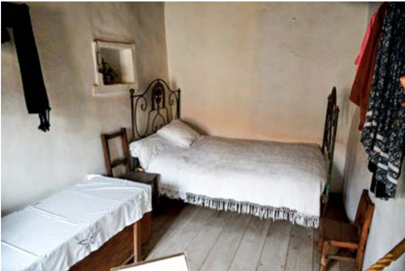
The bedroom at the home of the Marto family

And Lucia said, “One day, when I showed how unhappy I was over the persecution now beginning both in my family and outside, Francisco tried to encourage me with these words: ‘Never mind! Didn’t Our Lady say that we have much to suffer, to make reparation to Our Lord and to her own Immaculate Heart for all the sins by which They are offended? They are so sad! If we can console Them with these sacrifices, how happy we shall be.’”